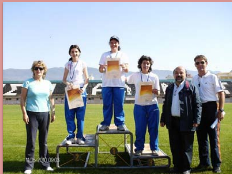
Women medal ceremony