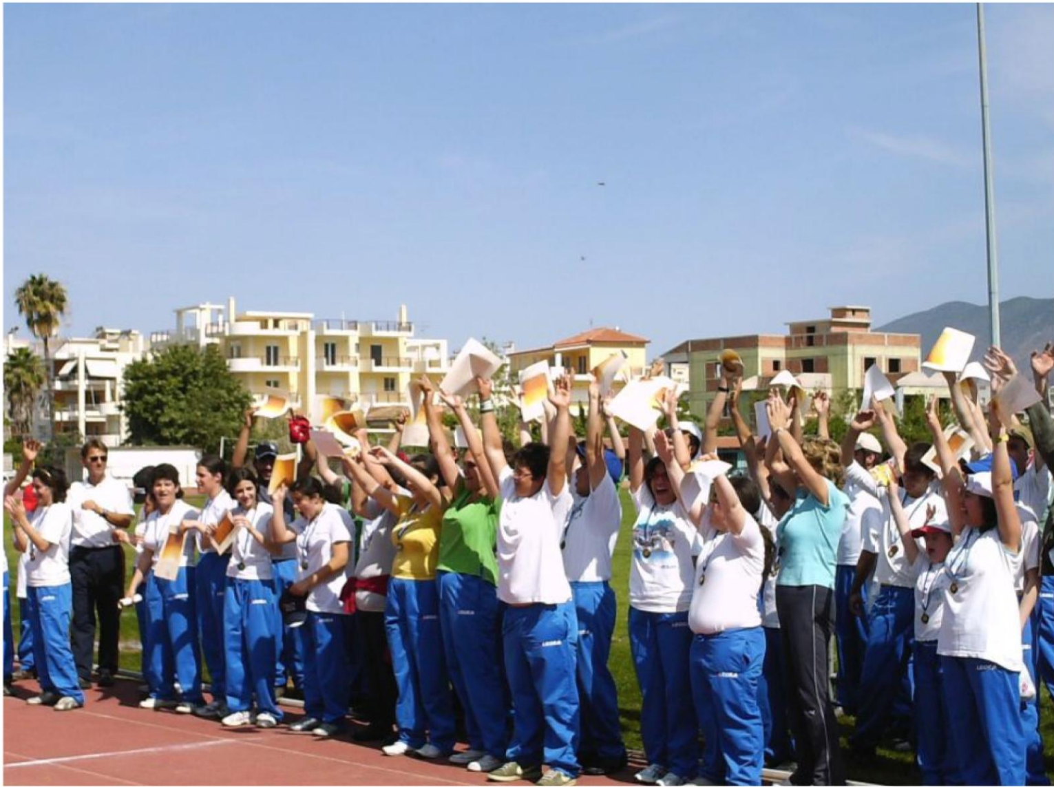
The School's Annual Athletics Event: our own Special Olympics