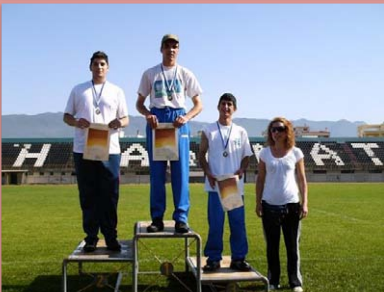
Men medal ceremony